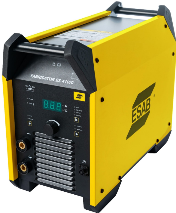
Fabricator ES 410iC